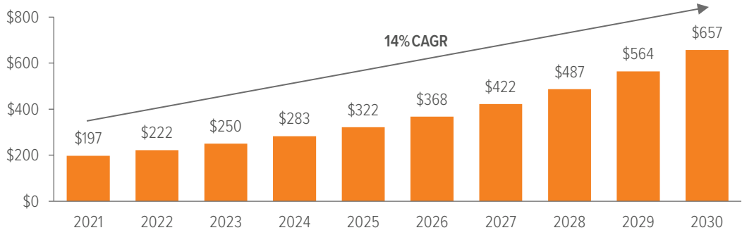
Exhibit 3: Global cybersecurity market expected to reach $657 billion by 2030

As of 04/25. Source. Suitshark Research. CAGK – compound annual growth rate.